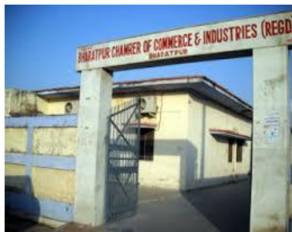
Industry at a Glance